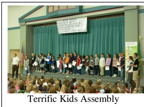
Terrific Kids Assembly