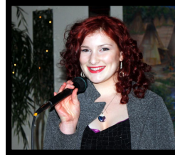
Last year's winner

Plans for StarSearch or underway, and the next StarSearch meeting will be on November 9th 6:30 at my house. Please come if you're interested in helping with this fundraiser.